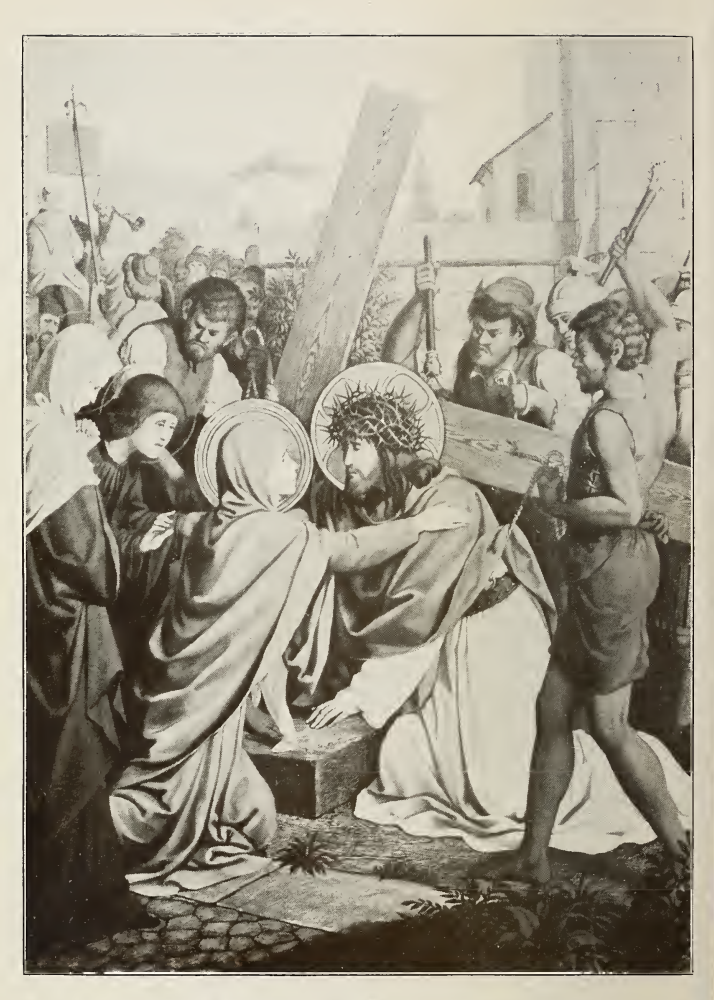
Fili mi — Mater mea